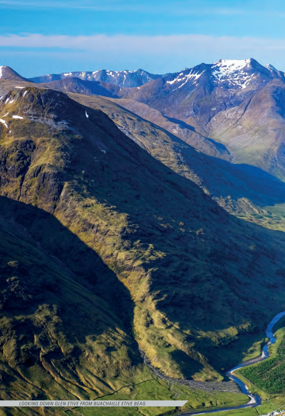
LOOKING DOWN GLEN ETIVE FROM BUACHAILLE ETIVE BEAG