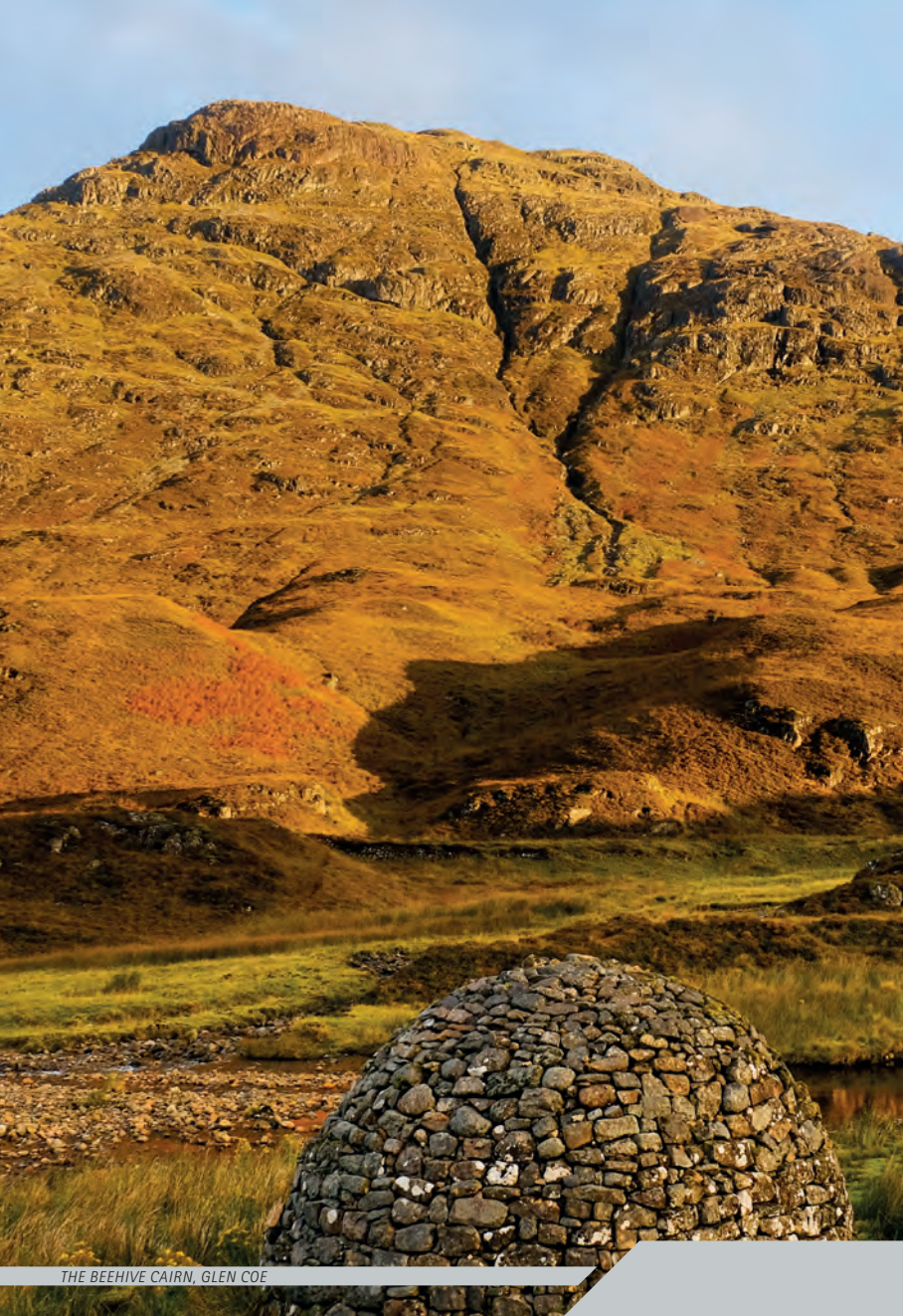
THE BEEHIVE CAIRN, GLEN COE