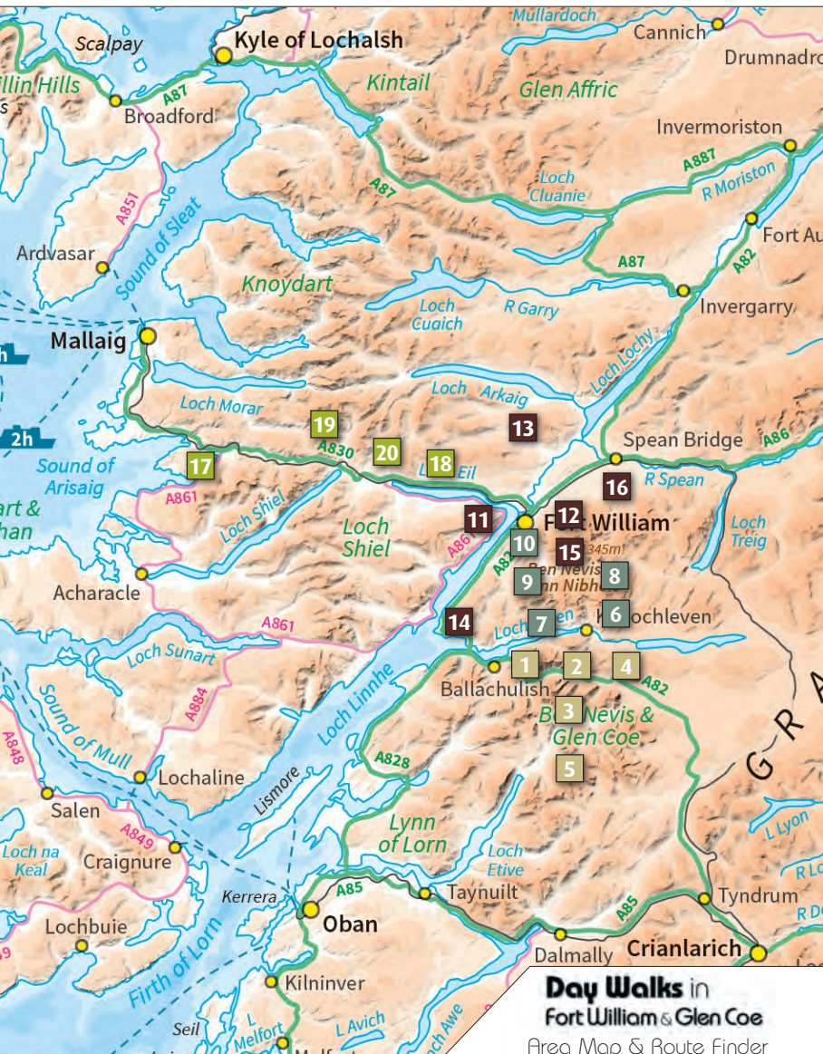
Day Walks in Fort William & Glen Coe Area Map & Route Finder