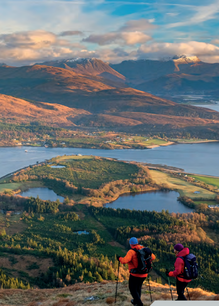
LOOKING ACROSS THE CORRAN NARROWS FROM DRUIM NA SGRÌODAIN