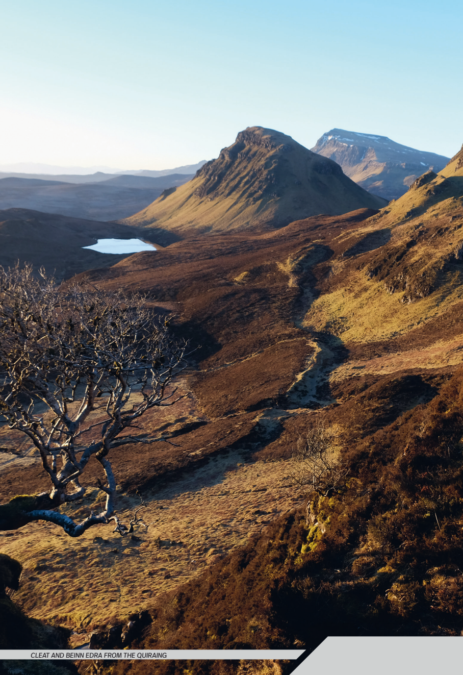
CLEAT AND BEINN EDRA FROM THE QUIRAING