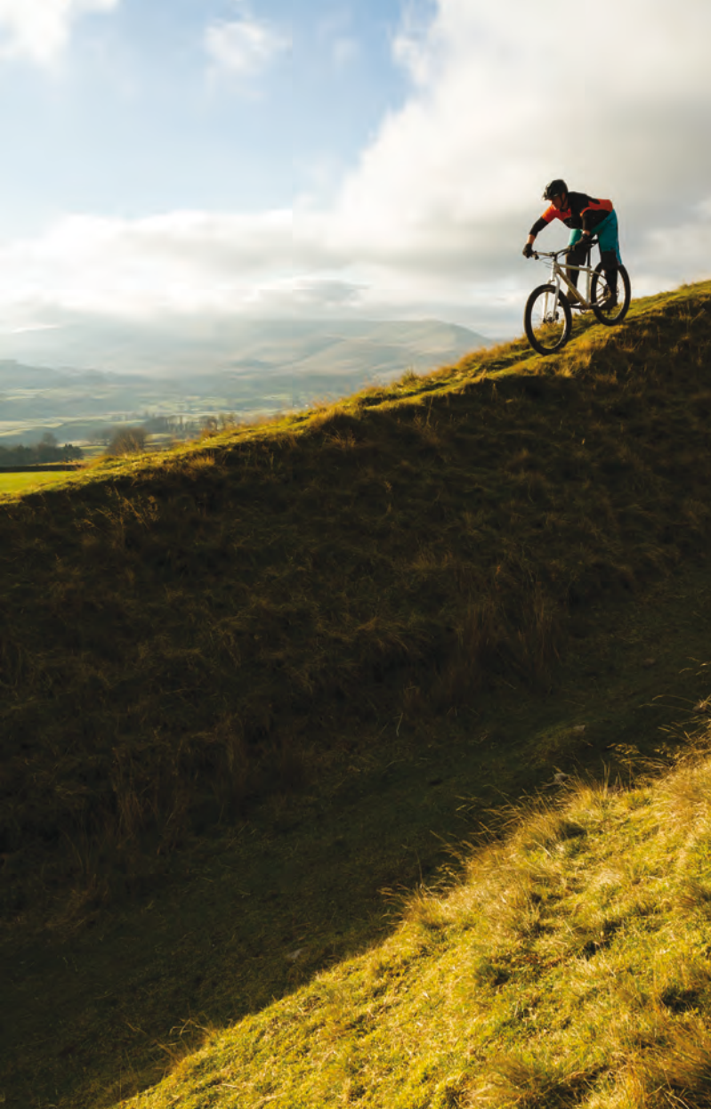
HANNAH COLLINGRIDGE DESCENDING INTO SEDBUSK (ROUTE 2)