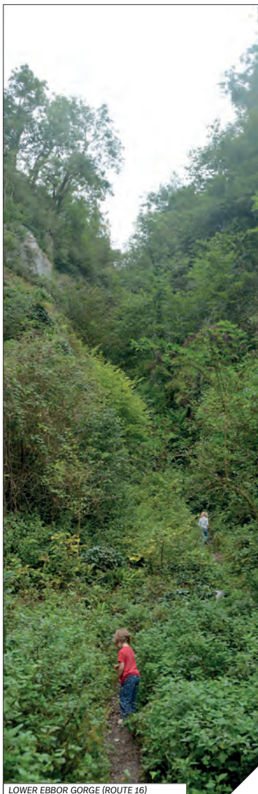
LOWER EBBOR GORGE (ROUTE 16)