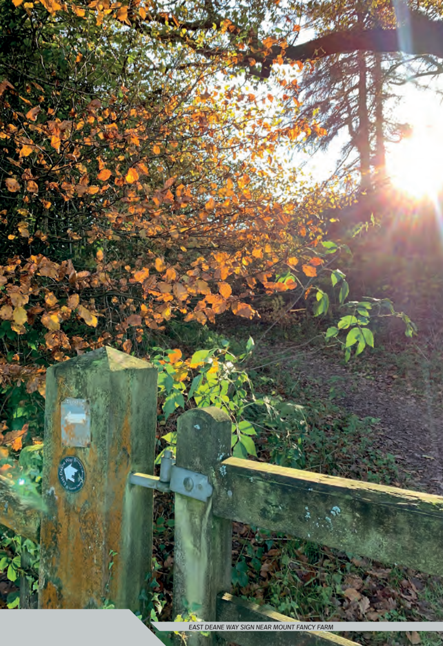
EAST DEANE WAY SIGN NEAR MOUNT FANCY FARM