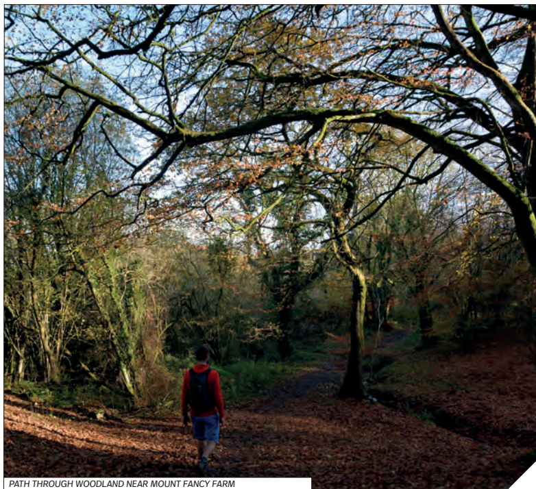
PATH THROUGH WOODLAND NEAR MOUNT FANCY FARM