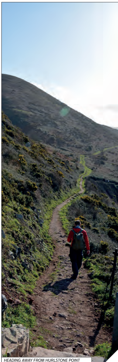
HEADING AWAY FROM HURLSTONE POINT